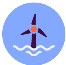
Marine Renewable Energies and Robotics

With the support of 14 partners from 9 countries , WIN-BIG is addressing gender imbalance and capacity gaps in the Blue Economy across all 6 EU sea basins , with a specific focus on 3 emerging sectors