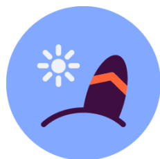
Sustainable tourism and blue sports